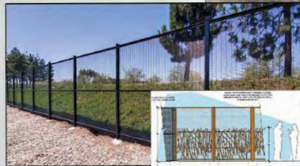
NO CLIMB PERIMETER SECURITY FENCE