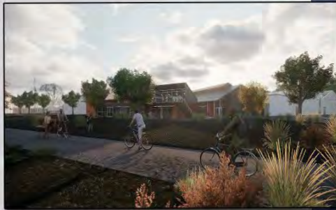
VIEW FROM BAY TRAIL