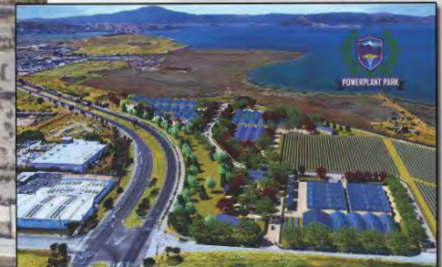
3D SITE PERSPECTIVE