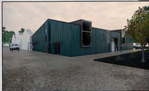
DISTRIBUTION AND PROCESSING