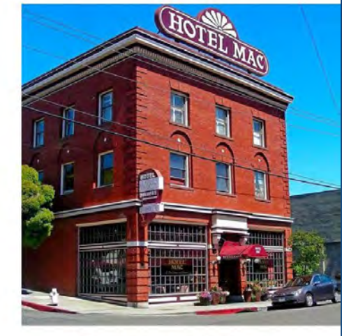
HOTEL MAC 4 MILES FROM SITE