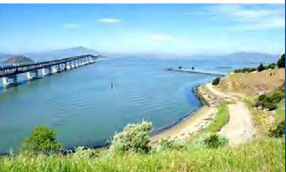
RICHMOND SHORELINE 4 MILES FROM SITE

MILES TO: OAKLAND - 15 SAN FRANCISCO - 25 SANTA BARBARA - 335 EUREKA - 265 LOS ANGELES - 390 MONTEREY - 125