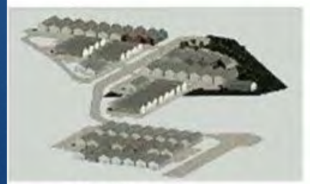
A EDIAL A